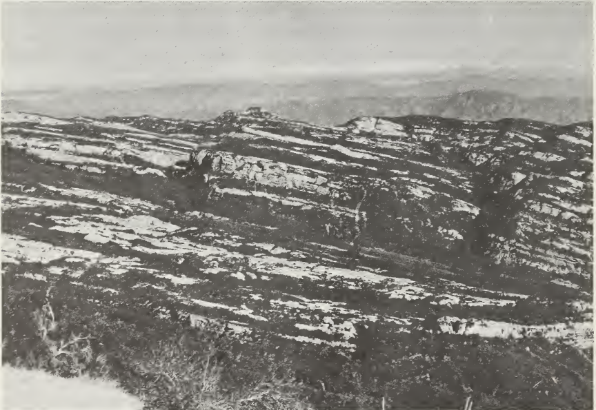
Fig. 7. Hopper Canyon, Sespe Condor Sanctuary, an important condor nesting and roosting area.